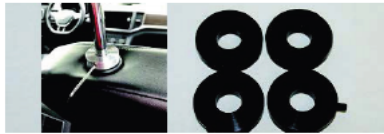
MODEL: GUIDE POST LOCKS

FOR VEHICLES WITH FLOATING GUIDE SLEEVE CAPS OR PLASTIC TRIM SEAT TOPS: